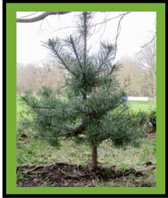
Scots pine sapling